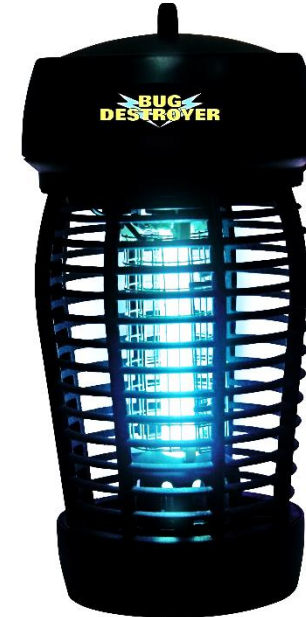
Electronic Bug Zapper Model BD10

NEED WARRANTY OR SERVICE? BEFORE RETURNING THIS PRODUCT TO RETAILER FREE CALL OUR CUSTOMER SERVICE DEPARTMENT ON 1 800 677 981