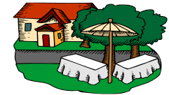
Outdoor Living Area

The UV Black Light Lamp is long wave and therefore safe. The output / intensity of the lamp in the invisible ultraviolet frequency range reduces with use. For maximum attraction of flying insects the lamp should be replaced every 12 months.