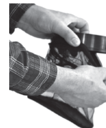
Attach catch net to quick lock adapter