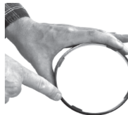
Quick lock adapter, note position of the bayonet fittings