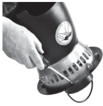
Using Phillips head screwdriver remove the 4 screws