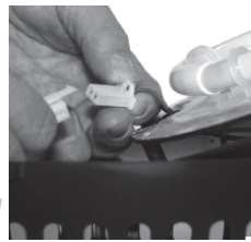
Disconnect the UV lamp