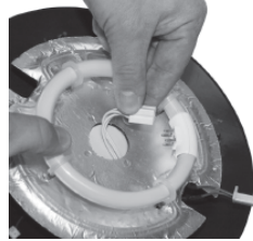
Disconnect the fan/switch connector