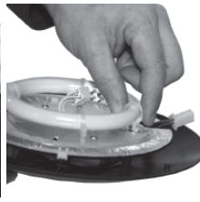
Disconnect the 4 lamp holders (grasp and turn gently inwards) Snap off the tube holders and attach new lamp