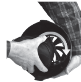
Push quick lock adapter towards fan ring and turn clockwise